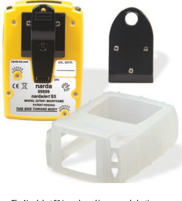
The Nardalert S3 is packaged in a rugged plastic housing and is available with a strong silicon rubber skin for additional shock protection.