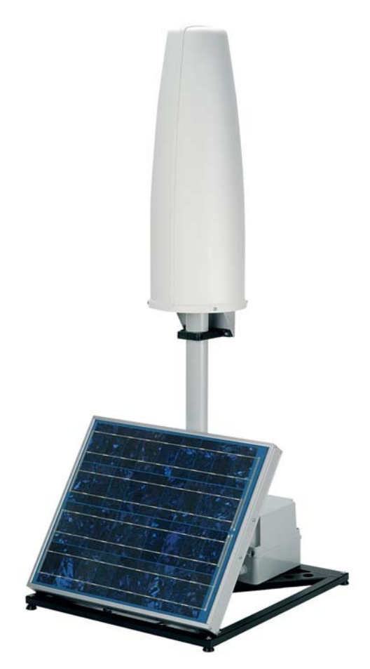
Area Monitor AMS 8060 with Solar Panel