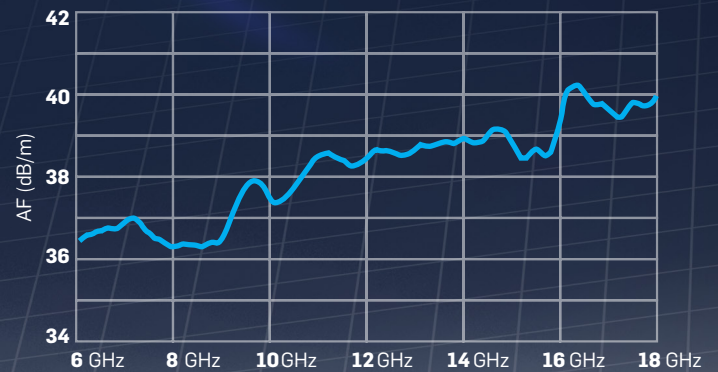
DR-01 - Antenna Factor