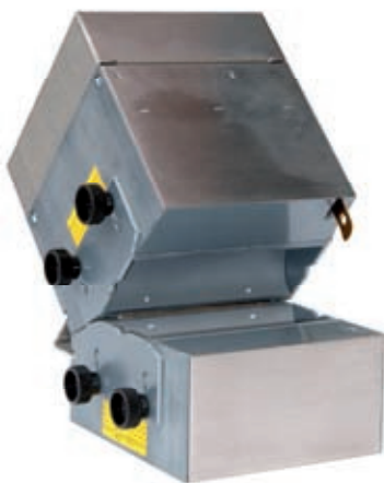
CVP 2200A, opened

The Capacitive Voltage Probe (CVP) is designed for measuring asymmetrical disturbances on cables with capacitive coupling principle. It gives the opportunity to do the measuring without disconnection of the tested cable ("in-situ") and it avoids the influence of the transmission. Main parameter of the CVP is the coupling factor, measured in a calibration system with 50 Ω impedance. The capacitive voltage probe is specified in chapter 5.2.2 and Annex G of CISPR 16-1-2.