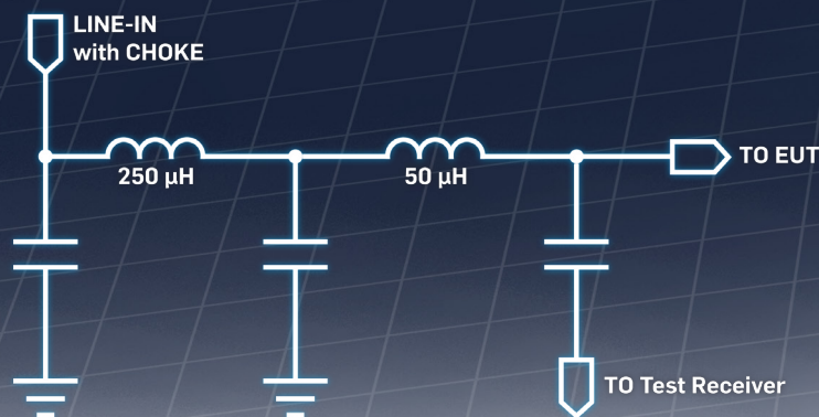
L2-16B equivalent circuit