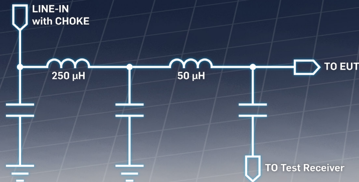
L3-100 equivalent circuit

(AC-BNC adapter for LISN verification and calibration)