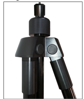
Telescopic support with locking, MPB block system, MPB hooking screw and 1/4 inch adapter