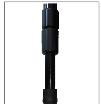
Telescopic legs with locking and non-slip feet